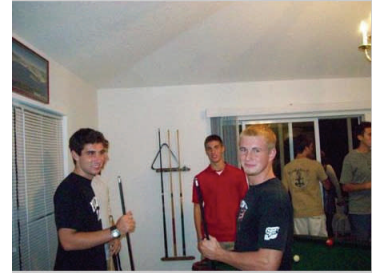
Rush event: Get Crabs from the Brothers of Chi Phi

Just to give a heads-up as well, the chapter and I will be