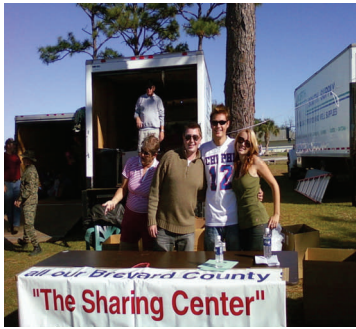
Above: Toys 4 Tots