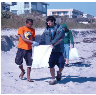
Below: Beach clean up

'A new program to be implemented to excite incoming members is the new 'actives 4 actives' scholarships'