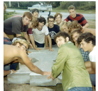
One of the pictures given from the 70's

The brothers at Xi delta will look forward to see you for alumni weekend! April 3-4... come out for Skinners and Skinny Dippers!